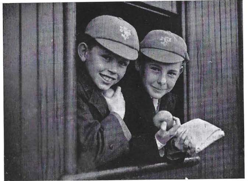
OFF FOR THE HOLIDAYS