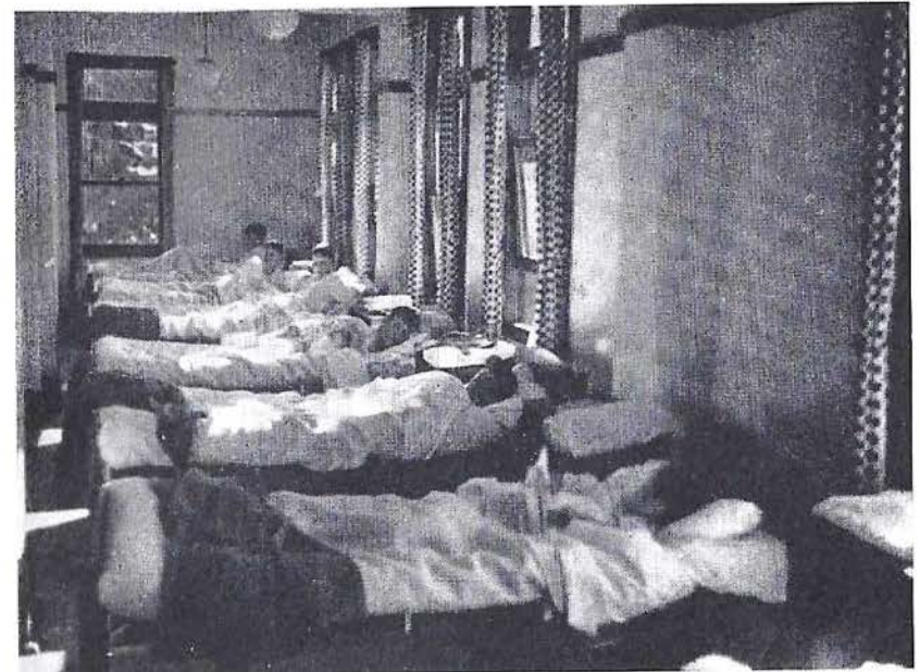
A CORNER OF THE RED DORMITORY